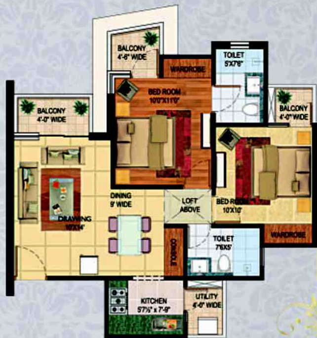
TYPE 2 2BHK + 2T + Living + Dining + Kitchen + Utility + Balconies SUPER AREA = 840 sq. ft.