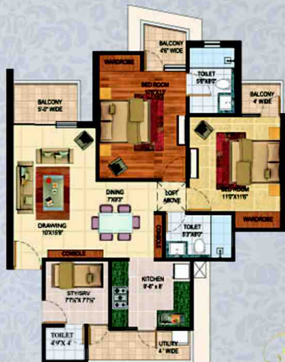
TYPE 4 2BHK + 3T + STY/SRV + Living + Dining + Kitchen + Utility + Balconies SUPER AREA = 1150 sq. ft.