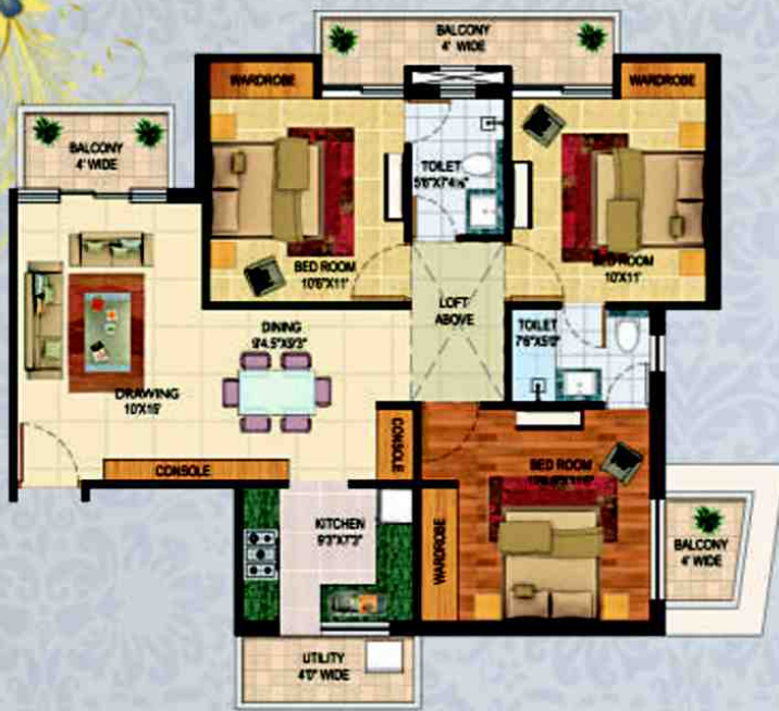
TYPE 5 3BHK + 2T + Living + Dinning + Kitchen + Utility + Balconies SUPER AREA = 1255 sq. ft.