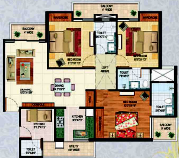
TYPE 6 3BHK + 4T + STY/SRV + Living + Dinning + Kitchen + Utility + Balconies SUPER AREA = 1480 sq. ft.