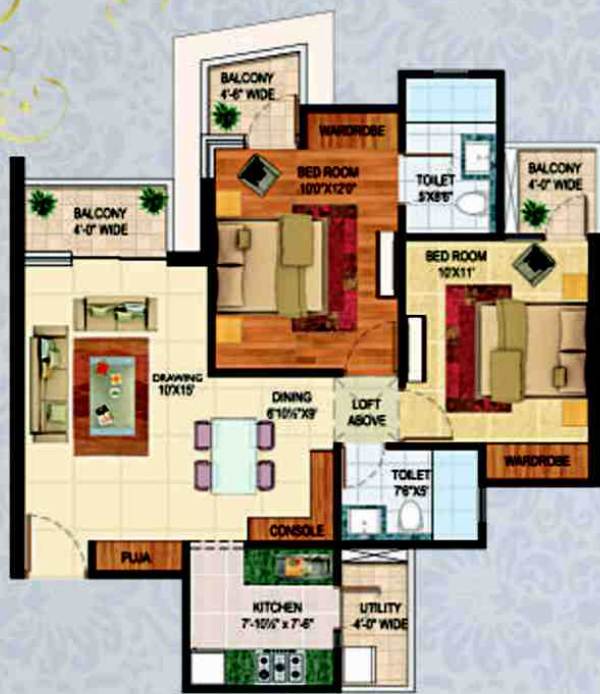
TYPE 3 2BHK + 2T + Living + Dining + Kitchen + Utility + Balconies SUPER AREA = 940 sq. ft.