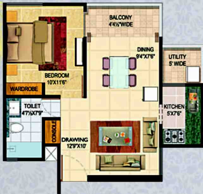
TYPE 1 1BHK + 1T + Living + Dining + Kitchen + Utility + Balcony SUPER AREA = 590 sq. ft.