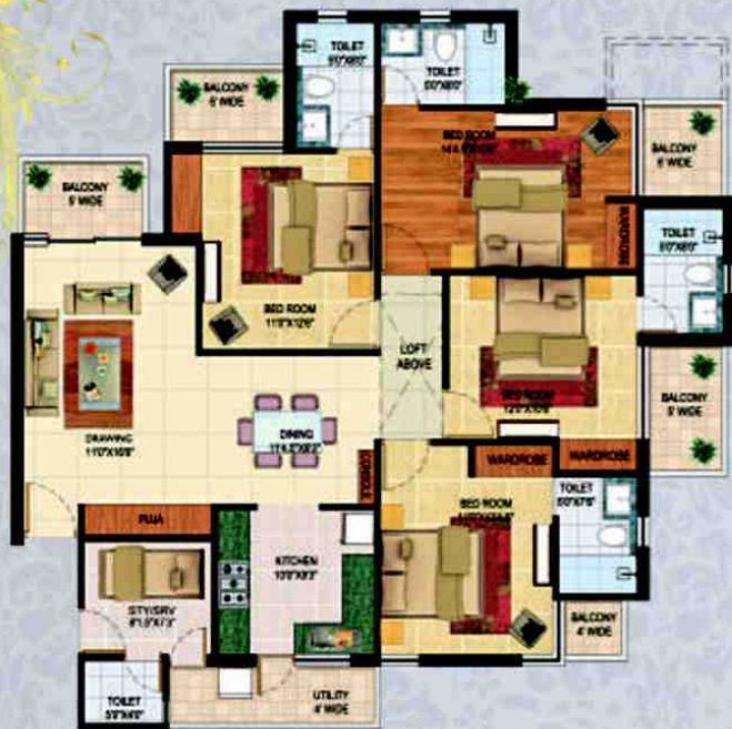
TYPE 7 4BHK + 5T + STY/SRV + Living + Dinning + Kitchen + Utility + Balconies SUPER AREA = 1920 sq. ft.